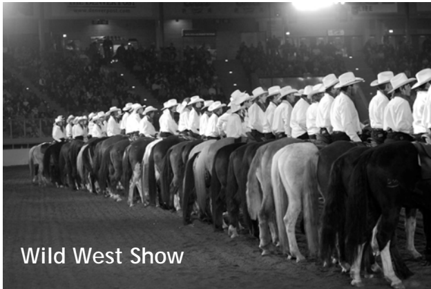
Wild West Show